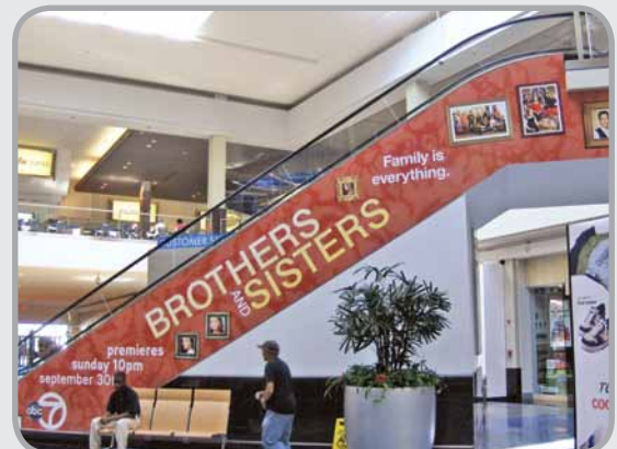
Escalators, Elevators & Stairs